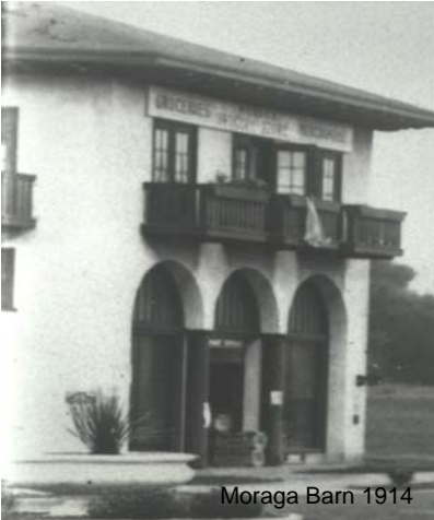
Moraga Barn 1914